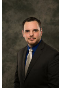
Office Manager & Technical Support Staff